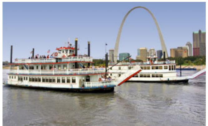
Above: Becky Thatcher and Tom Sawyer riverboats on the St. Louis Riverfront