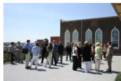
Networking on the terrace.

If you missed the meeting and would like more information about the presentation the power point is available on our web site at www.stlattractions.org .